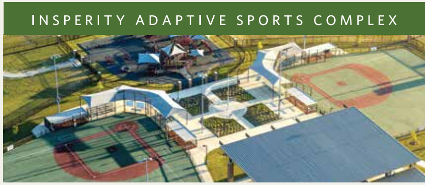
INSPERTY ADAPTIVE SPORTS COMPLEX