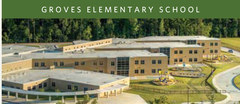
GROVES ELEMENTARY SCHOOL