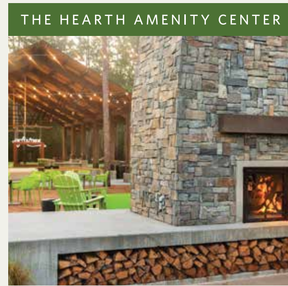
THE HEARTH AMENITY CENTER