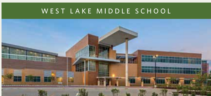
WEST LAKE MIDDLE SCHOOL