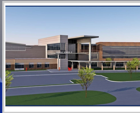
West Lake Middle School